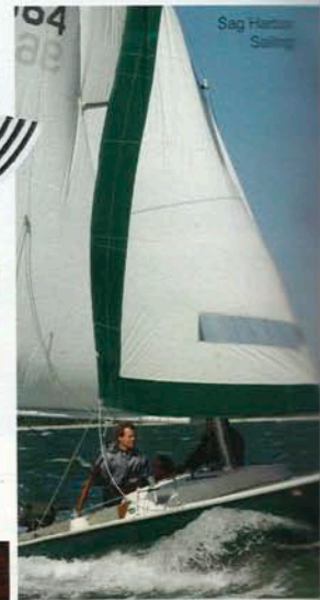
Sag Harbor Sailing