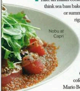
Nobu at Capri