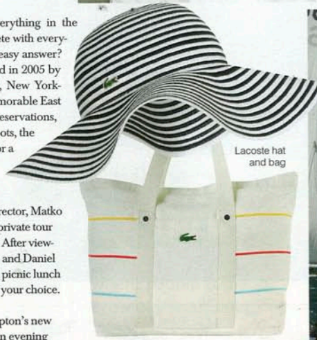
Lacoste hat and bag